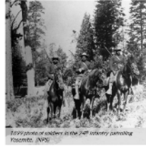
Early photos of soldiers in the 1st Infantry protecting Yosemite, NPS

ARLINGTON NATIONAL CEMETERY HISTORY EDUCATION SERIES