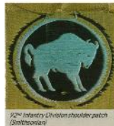
92nd Infantry Division shoulder patch

ARLINGTON NATIONAL CEMETERY HISTORY EDUCATION SERIES